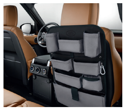
Seat Back Stowage

Provides convenient stowage solution for the rear of the front seats with multiple compartments for stowing small items.