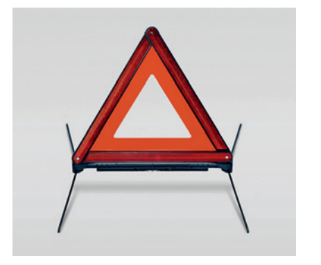
Warning Triangle Vital in emergencies. Stows in the loadspace compartment.