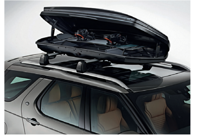
Roof Box Ski/Snowboard Inserts A secure way to fasten skis or snowboard within the sports roof box or luggage roof box.