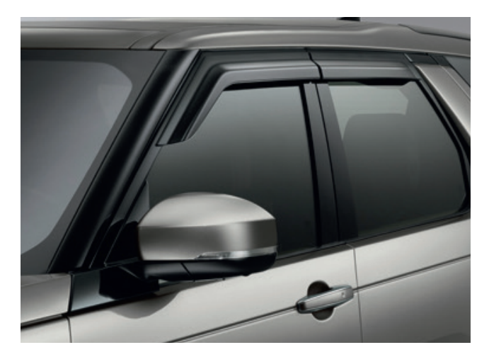
Wind Deflectors - Tinted

Wind deflectors for side windows help to improve comfort levels in the cabin when driving with windows open, by reducing air turbulence and noise and allowing fresh air to be circulated in the cabin.