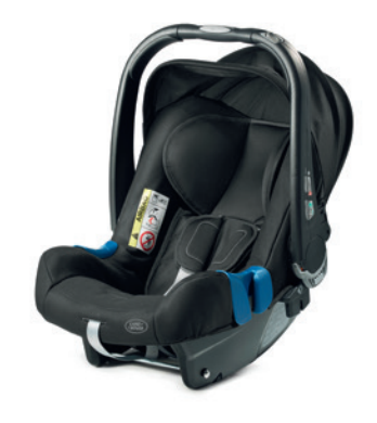
Child Seat – Group 0+, Cloth, Land Rover For babies from birth to 13kg (approximately birth to 12 – 15 months). Land Rover branded. Rearward facing on rear seat. Includes wind/sun canopy and padded and machine washable cover. Easy, height adjustable headrest and five-point harness with one-pull adjustment. Can be installed with the vehicle's three-point seat belt or the child seat ISOFIX base. Approved to European test standard ECE R44-04.