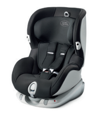
Child Seat – Group 1, Cloth, Land Rover For children 9kg – 18kg (approximately 9 months – 4 years). Land Rover branded. Forward facing on rear seat. Padded machine washable cover. One pull, height adjustable headrest and five-point harness. Improved side impact protection. Multi-position recline system. ISOFIX fitment only. Indicators confirm the ISOFIX has been correctly installed. Front ISOFIX release for ease of use. Approved to European test standard ECE R44-04.