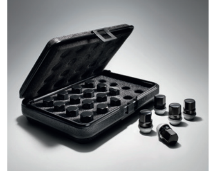
Wheel Nuts – Gloss Black Finish A set of 20 wheel nuts to complete the finish of the Gloss Black alloy wheels.