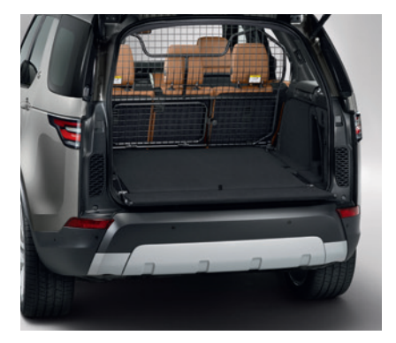
Luggage Partition – Full height

Practical and minimal accessories designed to keep your luggage organised and secure, while also protecting the interior of your vehicle.