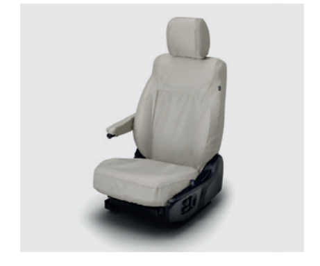
Protective Seat Covers – Light Oyster Helps protect seats from mud, dirt, wear and tear. Easily fitted and wipeable.

Complete the look and feel of your steering wheel with premium aluminium paddles. Gearshift paddles are machine polished, anodised and hand brushed to provide exceptional wear resistance with a premium finish.