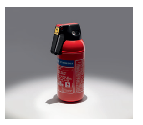
Fire Extinguisher – 1kg Dry powder fire extinguisher, supplied with mounting bracket.