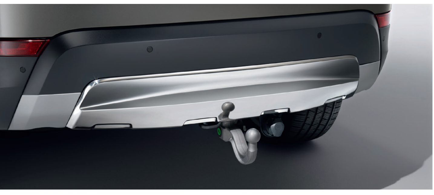
Towing System - Detachable Tow Bar

Convenient and easy to use, the detachable tow bar ensures a clean look when not in use. 50mm tow ball. Approved for up to 3,500kg maximum towing capacity and 195kg nose weight. Towing electrics are included.