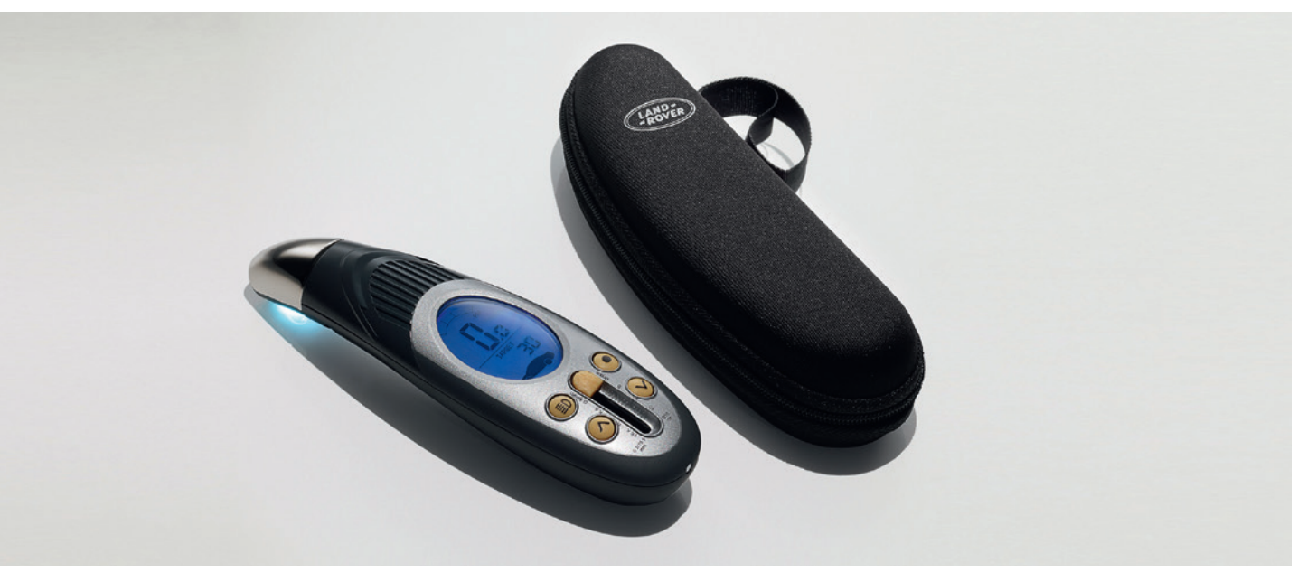
Tyre Pressure Gauge

Digital tyre pressure gauge which stores recommended pressure and has a 360° rotating nozzle to locate tyre valve, LED light to locate tyre valve, tread depth gauge to measure tyre tread depth, measuring in psi, bar, kPa, kg/cm². Range 0-99 psi / 0-7 bar and comes complete with storage case.