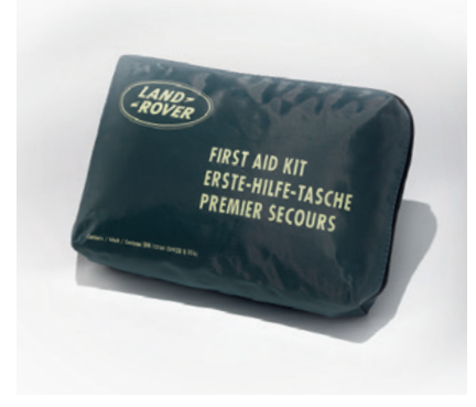
First Aid Kit Aids in the treatment of minor cuts and grazes.