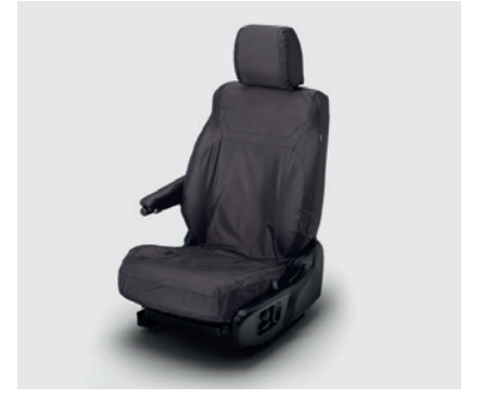
Protective Seat Covers – Ebony Helps protects seats from mud, dirt, wear and tear. Easily fitted and wipeable.