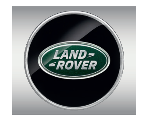
Wheel Centre Cap – Black Finish Enhances and adds style to alloy wheels. Features Land Rover logo.

Digital tyre pressure gauge which stores recommended pressure and has a 360° rotating nozzle to locate tyre valve, LED light to locate tyre valve, tread depth gauge to measure tyre tread depth, measuring in psi, bar, kPa, kg/cm². Range 0-99 psi / 0-7 bar and comes complete with storage case.