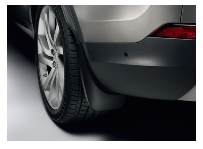
Mudflaps – Front and Rear

Mudflaps are a popular upgrade for reducing spray and ensuring paintwork is protected from debris and dirt whilst complementing the vehicle's exterior design.