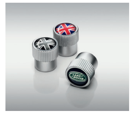
Styled Valve Caps This exclusive range of styled valve caps, available in a choice of designs, provides a subtle styling enhancement to alloy wheels.