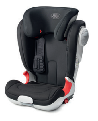
Child Seat – Group 2/3, Cloth, Land Rover For children 15kg – 36kg (approximately 4 – 12 years). Land Rover branded. Forward facing on rear seat. Padded machine washable cover. Height adjustable headrest and upper seat belt guides ensures correct seat belt position. Improved side protection from deep, padded side wings. Can be installed with the vehicle's three-point seat belt or ISOFIX system. Approved to European test standard ECE R44-04.