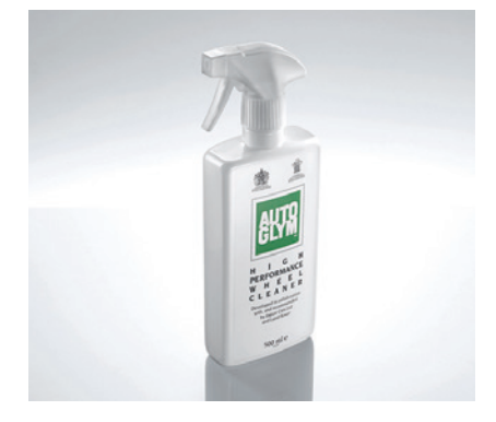
Wheel Cleaner – 500ml Trigger Spray Specially formulated by Autoglym for Land Rover vehicles, this wheel cleaner removes brake dust and road grime keeping your alloy wheels looking as good as new. For use with wheel cleaning brush.