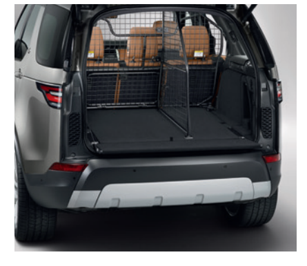
Luggage Partition - Divider

Available as full height and half height, the luggage partition is designed to prevent luggage from entering the passenger compartment. The design of the luggage partition has been optimised to second row seating featuring tilt functionality.