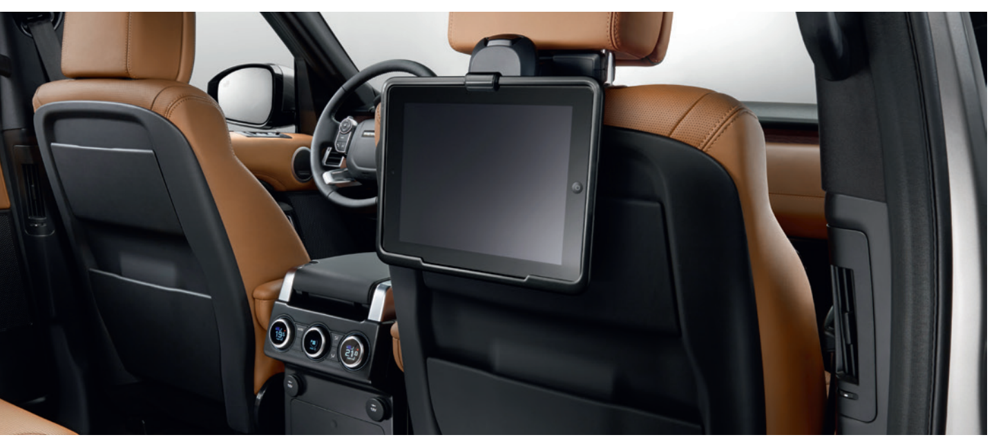
Click and Play*

This removable tablet holder attachment can easily be positioned at multiple angles for in-cabin comfort and rear entertainment.