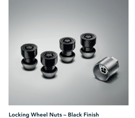
Manufactured to demanding safety standards, locking wheel nuts provide added security at low cost for valuable wheels and tyres. Kit includes a set of four locking wheel nuts and one key tool.