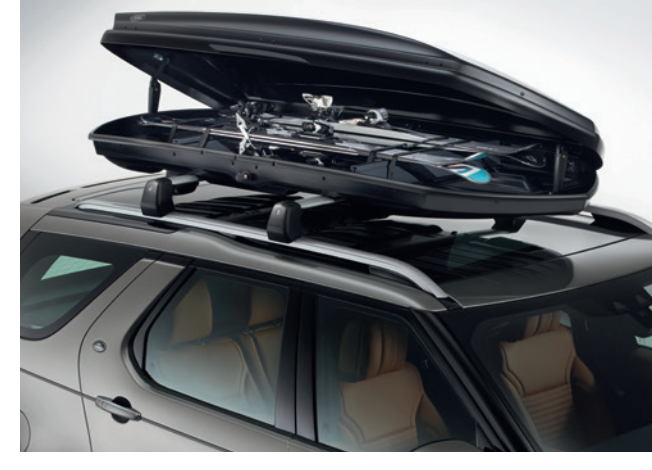
Roof Box Ski/Snowboard Inserts – Large A secure way to fasten skis or snowboard within the large sports roof box.