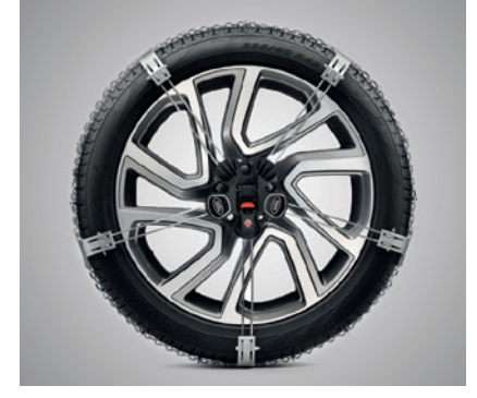
Snow Traction System – 19" to 21" Wheels Snow traction system is designed to give improved steering and braking control on snow and ice, when fitted to front wheels. Easy-fit design, manufactured from high quality hardened galvanised steel, the chains are supplied in a tough vinyl carry bag for storage when not in use.