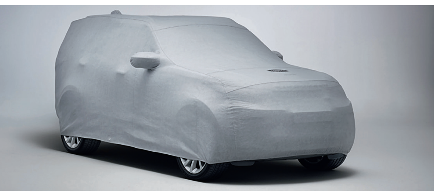
All-Weather Car Cover

All-weather tailored cover protects your Discovery from the elements including showers, frost, snow and dust. Quick and easy to fit.