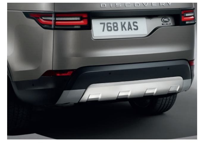
Stainless Steel Undershield - Rear

Wind deflectors for side windows help to improve comfort levels in the cabin when driving with windows open, by reducing air turbulence and noise and allowing fresh air to be circulated in the cabin.